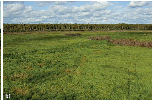
Fig. 24.2.20. (a) Shrub clusters are fragmenting the landscape and decrease the suitability of the grassland for waders in "Sitas un Pēdzes paliene" Nature Reserve. (b) The grassland became more suitable for waders after the removal of shrubs.