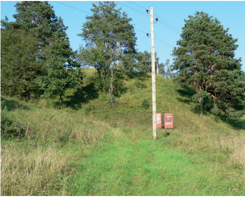
Fig. 24.2.14. Asote hillfort in 2005.