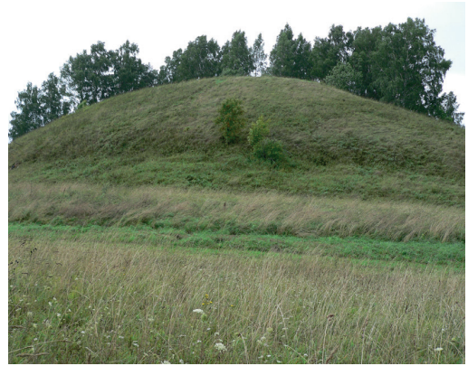
Fig. 24.2.15. The southern slope of Kņāvi hillfort in 2005.