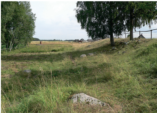
Fig. 24.2.10. A pasture enclosure and stones create diverse micro environments for plant and animal species.