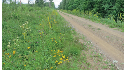
Fig. 24.2.5. If the roadsides are well lit, grassland species can also disperse through a forest landscape.