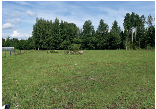
Fig. 24.2.11. A cluster of shrubs with stones.