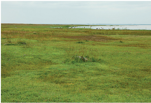
Fig. 24.2.18. The coastal grassland managed by grazing in "Matsalu" Nature Reserve in Estonia. The grassland is suitable for Calidris alpina schinzii and other waders. Vegetation is diverse with various height of sward. There are no elements fragmenting the landscape, for instance, towers, high trees or shrub belts. The stone increases the structural diversity of landscape, which is used by invertebrates.

Hillforts of the Bronze Age and Iron Age are a significant place of refuge for wild grassland species, because the southern slopes, due to their steepness and increased sun exposure take much longer to get overgrown with trees. Many hillforts even up to the middle of the 20 th century have been grazed, therefore, many of them have retained the vegetation of semi-natural grasslands (for instance, Arona