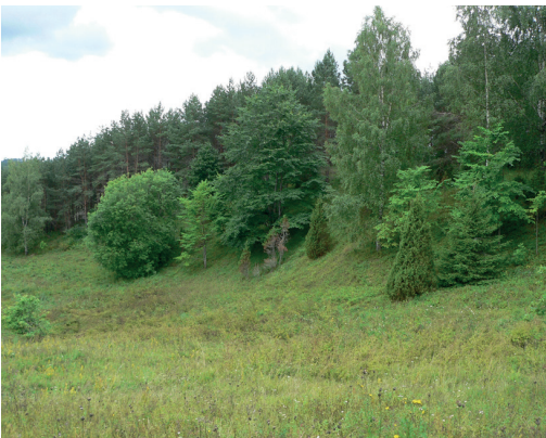
Fig. 24.2.16. The eastern slope of Pentjuši hillfort with junipers in 2005.