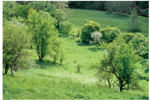
Fig. 24.2.19. Grassland with a considerable amount of trees and shrubs, which is suitable for passerines but completely unsuitable for waders. This particular grassland would not be suitable for waders even without trees and shrubs. The slope is too dry for waders, and the flat part is too narrow. For this reason, the trees and shrubs should be left as landscape elements (some of them can be removed to make the grassland more open). They increase the diversity of plants, invertebrates, and passerines.

The importance of wet depressions in grasslands or arable lands, which do not dry out until at least late May, is determined by their attractiveness for waders. If there are slacks with a constant presence of water, they are used by waterbirds. The effect of other natural or artificially created water edges is