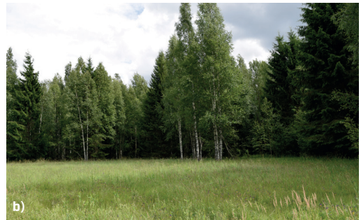
Fig. 24.2.7. Different forest edges. (a) A forest edge not suitable for high biodiversity – straight, sharp, without a gradual change of environmental conditions. (b) Ecotonal belt rich in species develops at the uneven forest edge.