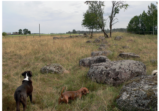
Fig. 24.2.9. A pile of stones. Not only can plant species find refuge here, but Lacerta agilis and grasshoppers are basking in the sun.