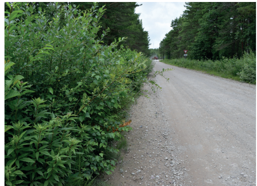
Fig. 24.2.4. A road verge unsuitable for the distribution of grassland species. Infrequent mowing resulted in roadside completely overtaken by shrubs. No space for the germination of herbs is available.