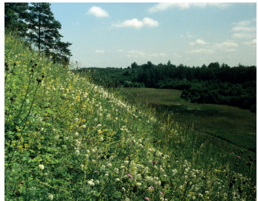
Fig. 24.2.17. Anemone sylvestris on the southern slope of Sudrabkalns hillfort in 2006.