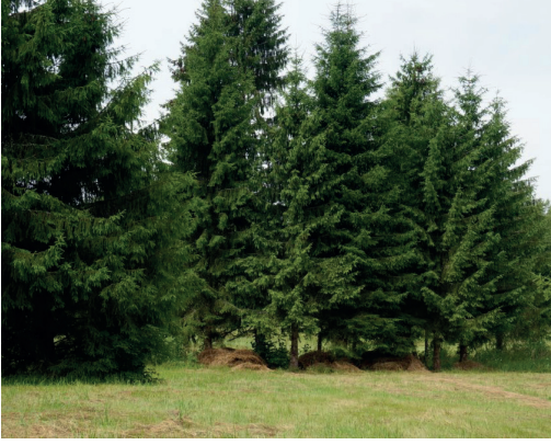
Fig. 24.2.12. A line of trees in the meadow, the significance of which has changed from favourable (increasing the diversity of species in the meadow) to unfavourable (reduces the diversity of species, promotes eutrophication and is a centre from where expansive species expand), because the grass mown during previous years is stored at the trees. This enriches the soil and promotes the introduction of expansive species.