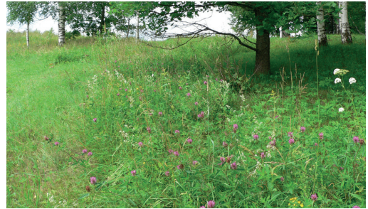
Fig. 24.2.6. A forest edge suitable for high biodiversity with a transitional zone into the forest, which consists of separate trees and grassland vegetation under them.