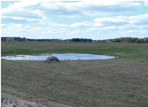
Fig. 24.2.8. A wet slack in spring provides a resting and feeding place for birds.

Various landscape elements – large solitary trees and clusters of shrubs, wet slacks, fences, piles of stones – are highly important in intensive agriculture landscape for wild plant and animal species as a living environment and hiding place (Fig. 24.2.8–24.2.11). It is recommended to preserve or to create at least a 3 m wide strip of semi-natural grassland around landscape elements, which is mown followed by grass removal once per year. Grass or hay should not be stored in such places (Fig. 24.2.12, 24.2.13). It is recommended to leave the piles of stones without tree and shrub cover, because sunlight and warmth is significant for animals who live there.