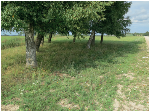
Fig. 24.2.3. Environmental conditions suitable for grassland plant species in the landscape of intensive agriculture can be found near solitary trees, shrubs and their groups.