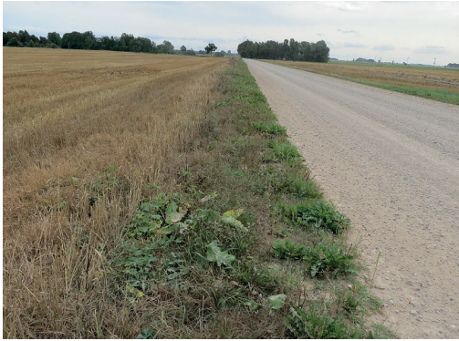
Fig. 24.2.1. A road verge unsuitable for grassland diversity conservation. It is too narrow, it is mown frequently and affected by herbicides used on the adjacent field.

ty (Fig. 24.2.1–24.2.5). Covering of the roadsides with soil should be avoided and plants should be allowed to spread themselves by seeds. Covering with soil not only limits the introduction of species typical for semi-natural grasslands (because it is too fertile), but can also facilitate the introduction of invasive species. Combating of invasive species may require huge investment of labour and resources. The best solution is bringing freshly mown grass of semi-natural meadow together with seeds and spreading it on the road verge. It is recommended to have trees in the grassland strips, especially in places with very intensive agriculture. In intensive agriculture landscapes road verges receive both fertilisers and herbicides and therefore they lack conditions that are suitable for semi-natural grassland species. If a tree grows on such a roadside, it protects the soil from