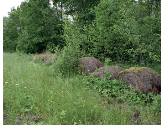
Fig. 24.2.13. Hay bales placed on the forest edge have facilitated eutrophication, and the forest edge no longer performs its functions.