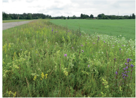
Fig. 24.2.2. A roadside suitable for grassland species diversity. It is sufficiently wide, not affected by the maintenance of arable land. It is not mown too frequently – plants manage to bloom and shed their seeds.