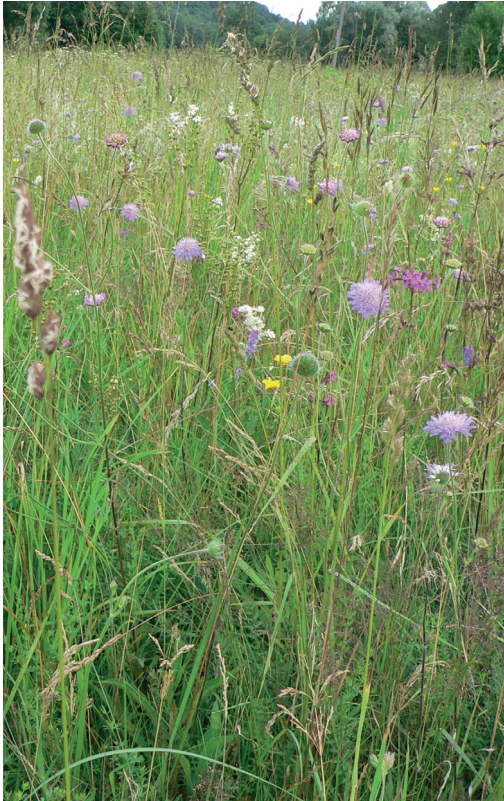
Fig. 18.1.7. Hay meadows in a favourable condition are very rich in plant species.

Although this habitat develops in soils that are some of the most fertile among semi-natural grasslands, their fertility is still much lower than in improved grasslands. Biodiversity decreases significantly, if the amount of phosphorus exceeds 50 \text{ mg kg}^{-1} (ac-