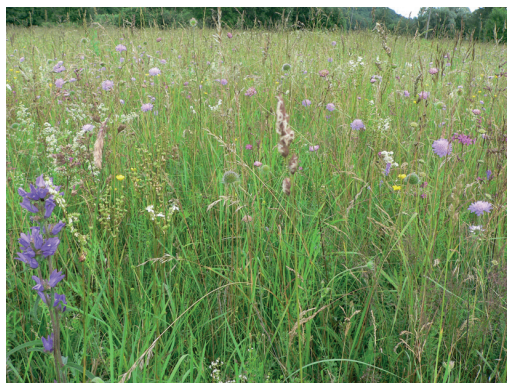
Fig. 18.1.6. A hay meadow with richly flowering forbs in Gauja floodplain, Gauja National Park.

schoenobaenus , Locustella naevia , Emberiza schoeniclus , often occur in hay meadows. The grassland also usually has a mosaic of low-density shrubs and shrub clusters that are suitable for certain passerine species ( Emberiza schoeniclus , Carpodacus erythrinus , Lanius collurio ). Porzana porzana and Rallus aquaticus occur in wet depressions. If the grassland area is large enough, Crex crex or some meadow wader species – usually Gallinago gallinago , on rare occasions also Vanellus vanellus , Tringa totanus also nest there, while Gallinago media can also occur in large and high-quality grasslands in river floodplains. Moderately damp grasslands are also used by Tetrao tetrix for lekking. If the grassland is next to a water body or water course with emergent vegetation mosaic, meadow ducks – Anas querquedula , A. clypeata , A. strepera – nest there. The presence of other species depends on the configuration of surrounding habitats – the