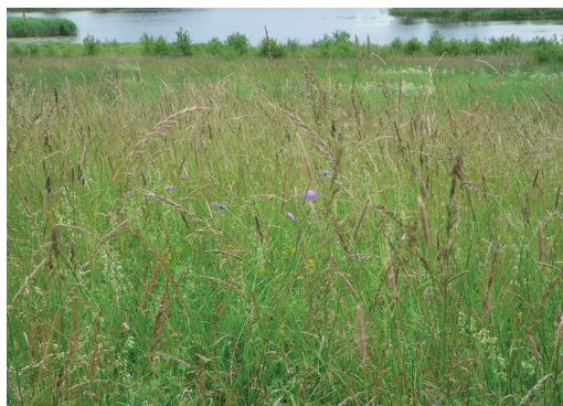
Fig. 18.1.5. A hay meadow near Lake Āraiši on a hill slope with a very rich grass species composition.