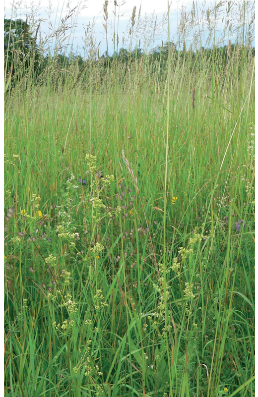
Fig. 18.1.8. Hay meadows are characterised by a tall grass layer ( Arrhenatherum elatius ) and slight occurrence of Dactylis glomerata , medium grass layer ( Briza media ) and forb layer ( Galium album , Lathyrus pratensis , Vicia cracca in the image).