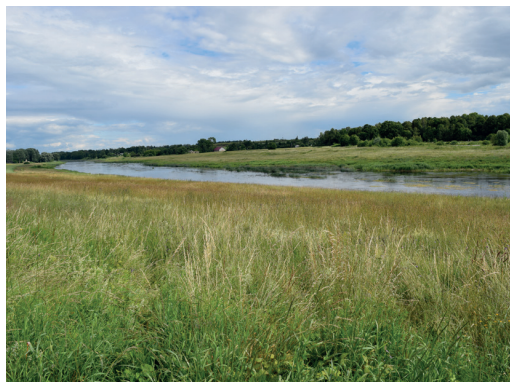
Fig. 18.1.3. Hay meadow in Lielupe floodplain near Bauska.