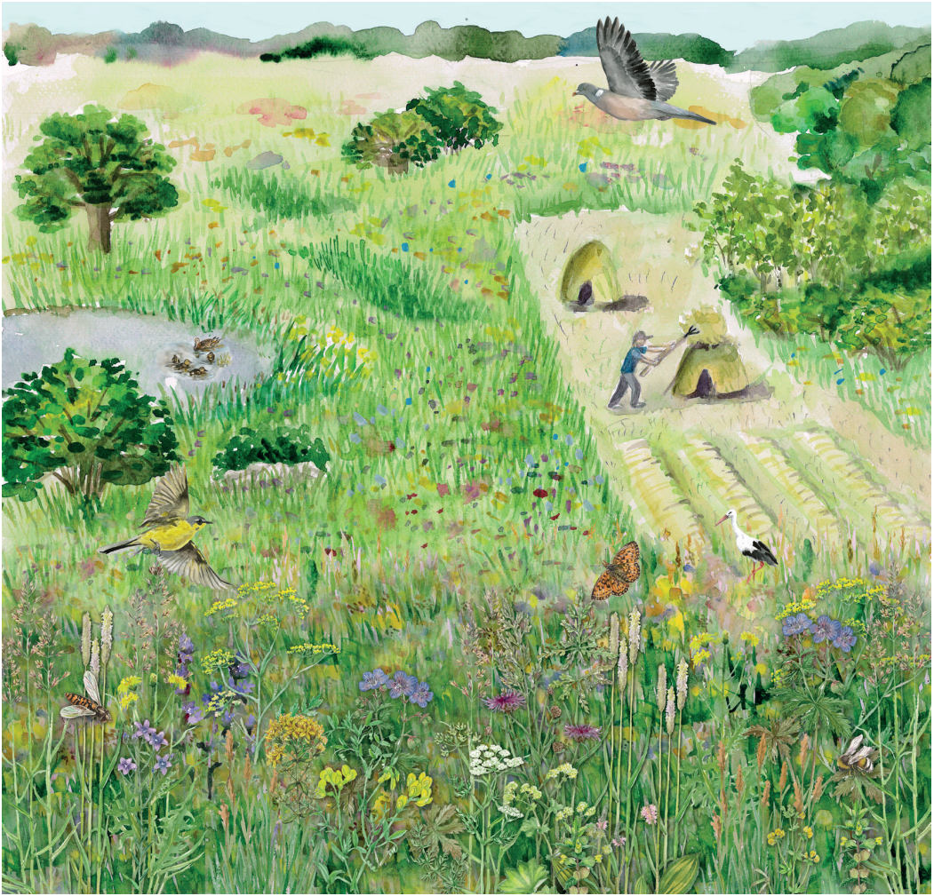
Fig. 18.1.2. An appropriately maintained habitat type 6510 Lowland hay meadows in a favourable condition. For differences from habitat type 6270* Fennoscandian lowland species-rich dry to mesic grasslands , see Insertion 2).

ording to the Olsen method), in the optimal case it should be much (under 25 mg kg -1 ) lower (Janssens et al. 1998).