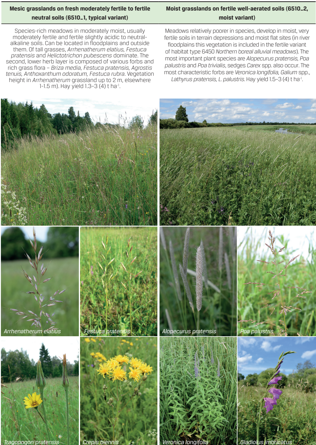
Table 18.1.1. Variants of habitat type 6510 Lowland hay meadows .