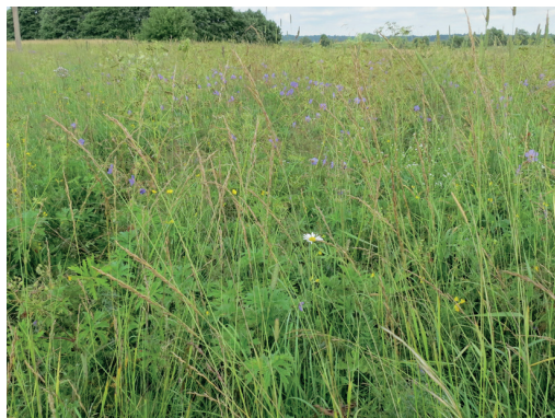
Fig. 18.1.4. Hay meadow with Festuca pratensis and richly flowering Geranium pratense in Venta valley near Piltene.